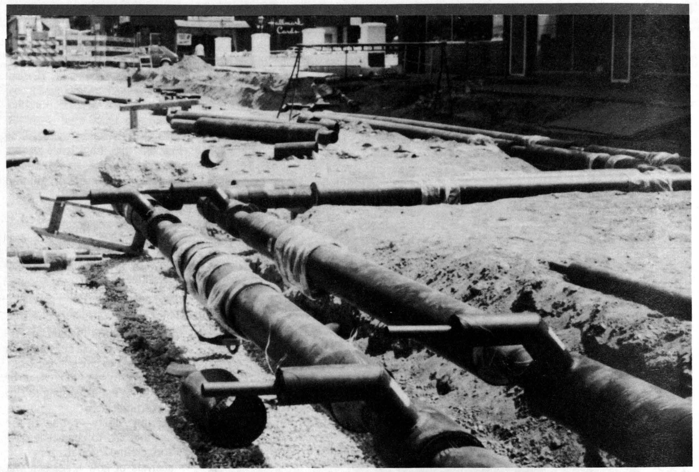
Installation of district heating system in Willmar. Following page: Willmar's district heating plant and downtown after completed pipe installation.